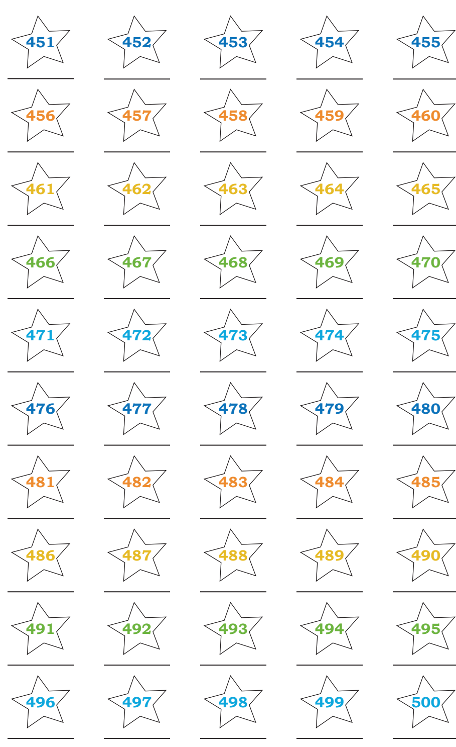
Congratulations! You're halfway to the 1000 book goal! Come into the library for a special prize and your next reading log.