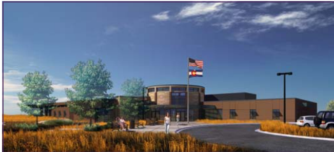
Carbon Valley Regional Library Opening Early 2008