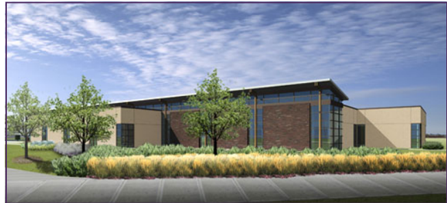
Erie Community Library Opening Early 2008